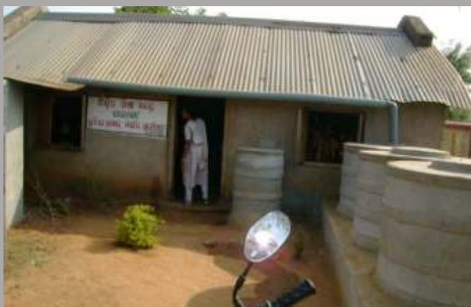
Child friendly toilets and rain water harvesting and utilization points are some of our innovations

If the child can not come to the school then the school must go to the child